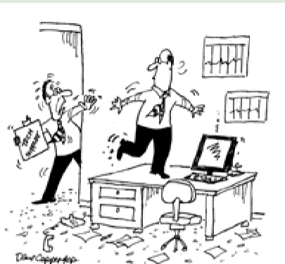
“Hold it! That's not what they mean by 'reboot.'”