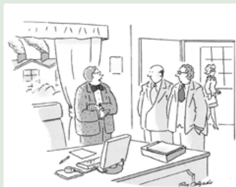
“We need to upgrade our tech help from my 12-year-old nephew.”